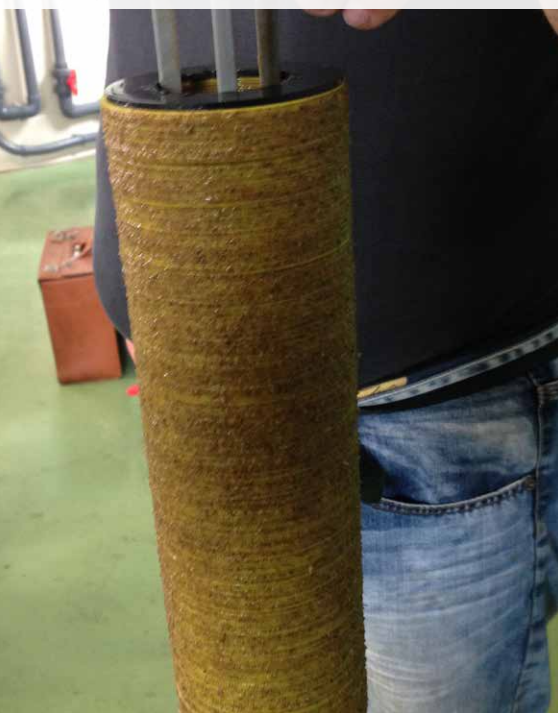
CLOGGED DISK FILTER

With this little shrewdness you have lot of advantages: